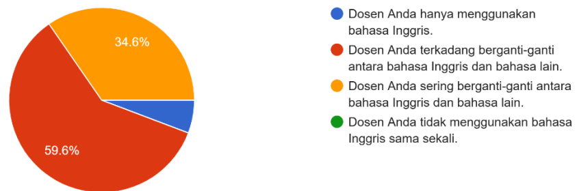
Figure 1. Respondents' Perceptions on Teachers' Code-Switching

Based on the chart above, for the option of your lecturer only using English, the percentage who chose this option is very small at 3.8% or 2 respondents, which shows that very few respondents prefer if their lecturers only use English. Furthermore, for your lecturer to sometimes alternate between English and other languages was the most dominant option, chosen by 59.6% (31 students) of the respondents. This figure shows that the majority of respondents are comfortable and prefer teaching methods where lecturers occasionally switch between English and another language (most likely Indonesian) for specific purposes. Then the option of your lecturer frequently switching between English and another language was the next most common choice, with the percentage choosing this option being 34.6% (18 students). This is the second most common option, indicating that most respondents also favored an approach where lecturers frequently switch between English and other languages. Whereas the option of your lecturer not using English at all did not have any respondents choosing it. This indicates that none of the respondents wanted English lessons to be taught entirely in a language other than English.